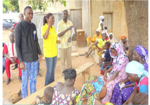
Sharing words of comfort & encouragement with IDPs in Ado Kasa II & IDP Reps from Karu, New Karu, New Nyanya, Fukka & Idu Yard