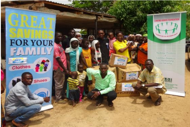
At Karshi with IDP Reps from Kurudi, Karshi & Kurape