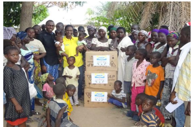
With IDPs in Jankawa