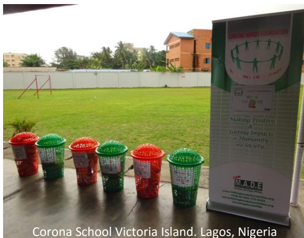
Corona School Victoria Island. Lagos, Nigeria