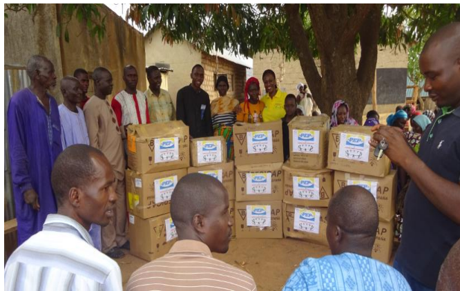
At Ado Kasa II with IDP Reps from Karu, New Nyanya, New Karu, Fukka, Idu Yard & Ado Kasa II